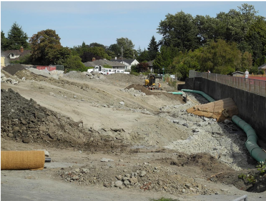
August 2015: Creek channel construction, including “islands” against concrete wall. North bank reconfigured with gentler slope for riparian planting and accessible pathways