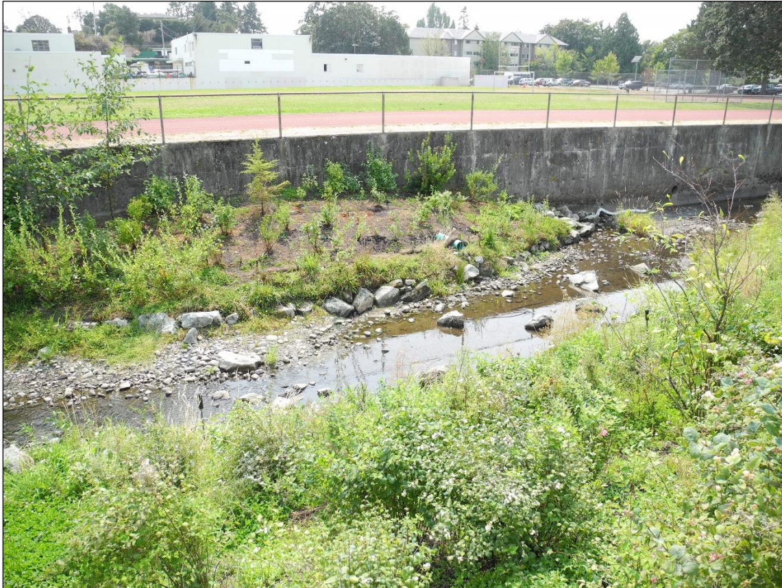
August 2017: Islands in the creek are becoming well vegetated, especially on the downstream side where sediments in the creek settle out