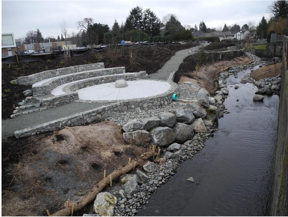
January 2016: Outdoor classroom and surrounding plantings, showing coir matting to hold soil in place as native plants get established