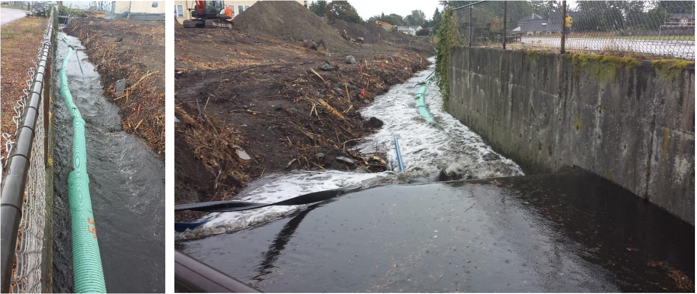
July 2015: First the creek flow was moved into a pipe, definitely a challenge in a ‘flashy’ urban creek during rain events