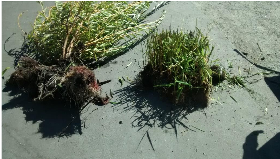
September 2017: Invasive Golden Willow pulled from creek banks. Root fragments and branches are carried downstream and take root throughout the creek. Volunteers and municipal staff are now working to remove Golden Willow from Bowker Creek and other urban waterways