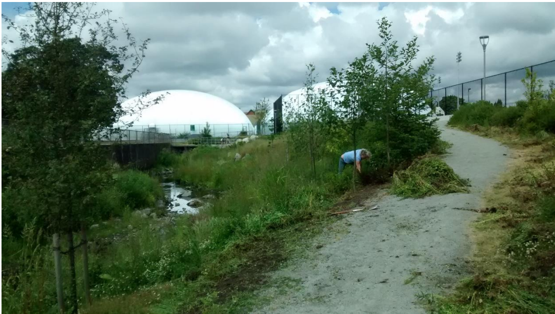
June 2017: BCI volunteers and Oak Bay High students were recruited to help weed the site and replant with more native plants