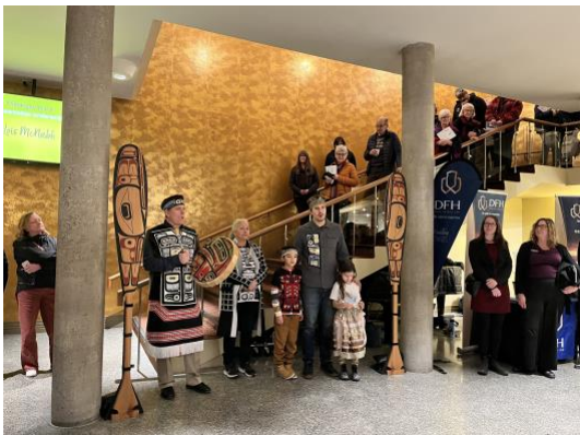
Dancers of Damelahamid lead traditional welcome in McPherson Playhouse lobby, Jan. 24, 2025.