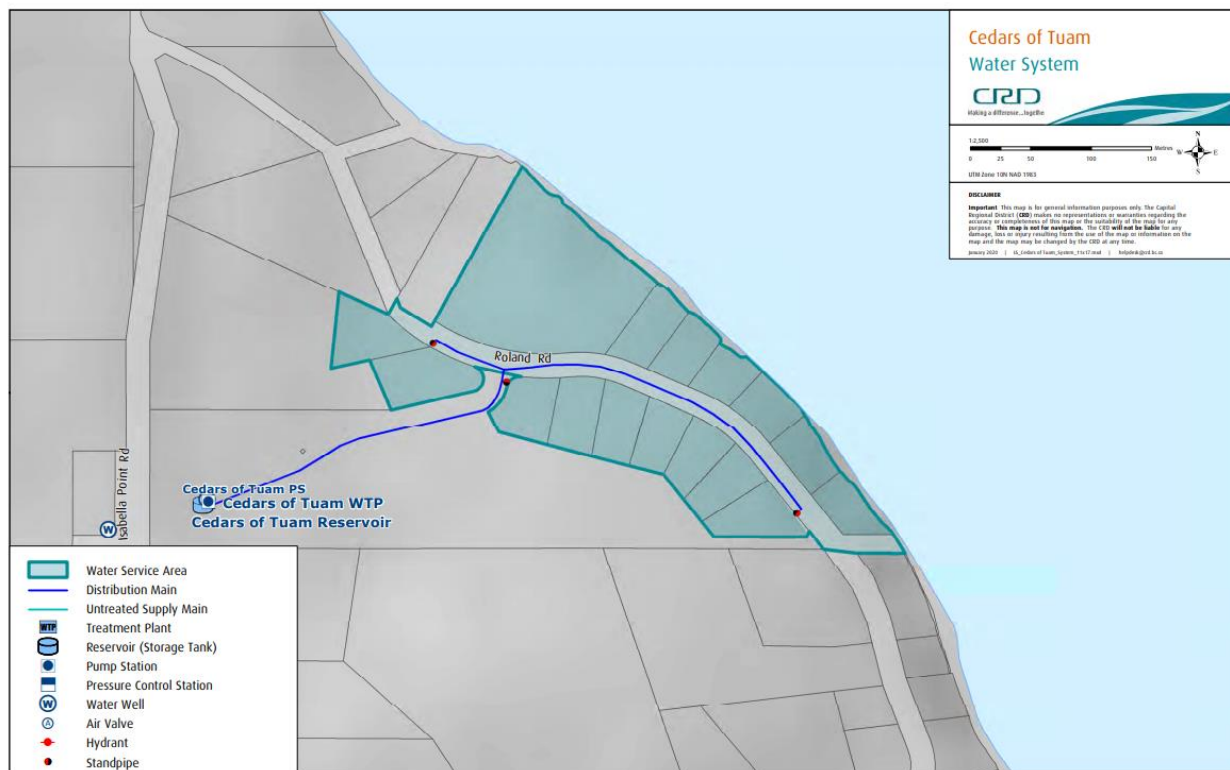
Figure 1: Cedars of Tuam Water Service

The Cedars of Tuam Water Utility is a rural residential community located on Salt Spring Island. The service was created in 1970 and became a CRD service in 2002. The Cedars of Tuam Water Utility (Figure 1) is comprised of 16 parcels of land 17 single-family equivalent connections.