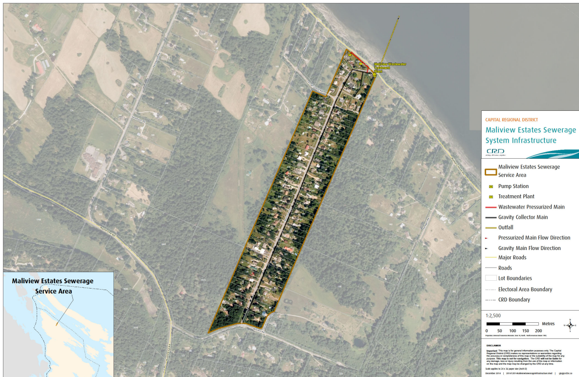
Figure 1: Maliview Sewer Service Area

The Maliview Sewer Service is in a semi-rural residential community located on Salt Spring Island. It is a sewage conveyance and treatment system that is owned and operated by the Capital Regional District (CRD) and services the Maliview Sewer Service Area, shown in Figure 1. The Maliview Sewer is comprised of 94 parcels of land of which 100 are presently connected to the system.