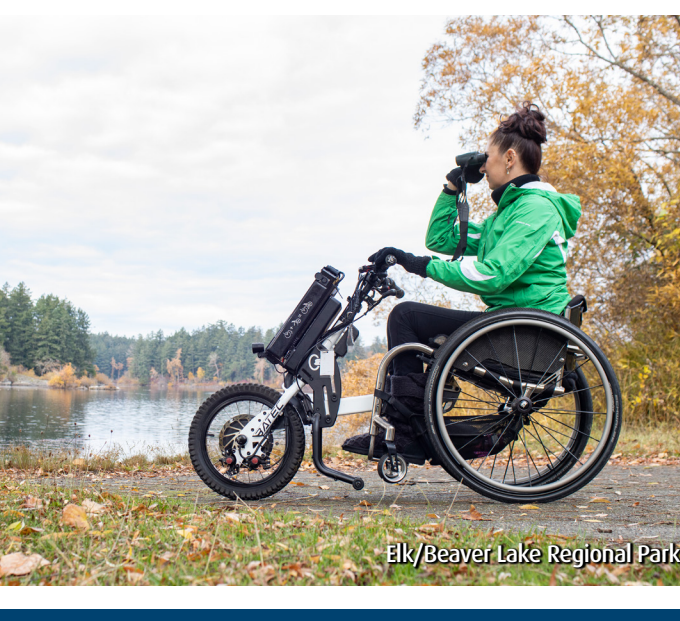
Elk/Beaver Lake Regional Park

Accessibility We offer programs for a variety of ages and abilities. Brief trail descriptions can be found under each program in the brochure. For more detailed accessibility information, please visit each program's description on our website: www.crd.ca/parks-events