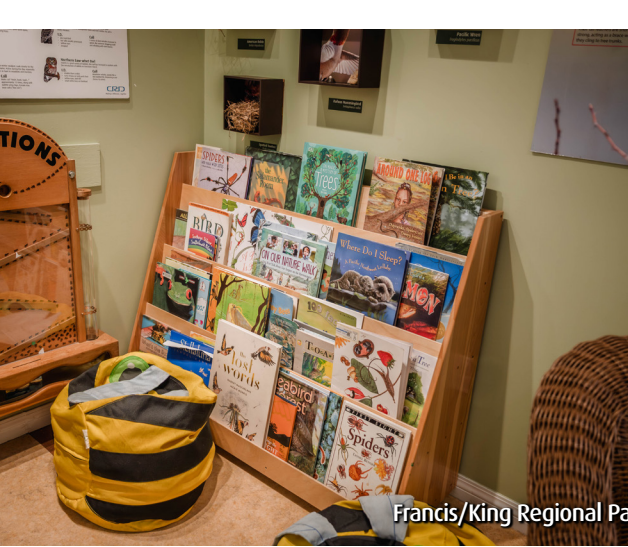
Francis/King Regional Park

Francis/King Nature Centre (Munn Road in Saanich) Open year-round - Saturdays, Sundays, holiday Mondays, 10am-4pm. The Nature Centre and the Elsie King Trail are wheelchair accessible.