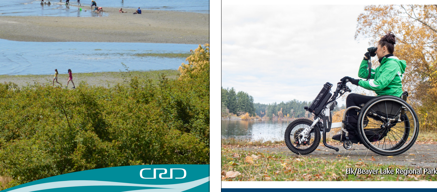
Elk/Beaver Lake Regional Park

Legend Drop-in Event - Come by anytime between the hours that the event is offered. Guided Walks - Have a casual pace with interpretive stops. Guided Hikes (Moderate) - Have occasional interpretive stops. Trails may be uneven and slippery with steep sections. The pace of the hike is set according to the needs of the group. Self-guided Walks - Follow interpretive signs at your own pace. User-friendly - Events and outings on these trails are suitable for many abilities. Check descriptions for personal suitability. Extreme Weather - Programs run rain or shine. In the event of air quality or wind warning, a program may be cancelled. If you suspect a program may be cancelled, call 250.360.3656 to hear a recorded message confirming the cancellation.