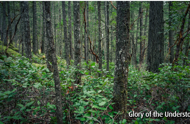
Glory of the Understory

Glory of the Understory (Self-guided Walk) - All Ages Devonian Regional Park (Metchosin) From the top to the bottom, each layer of the forest offers food and shelter for a variety of wildlife. We invite you to visit a CRD Regional Parks naturalist to learn more about this unique ecosystem and follow along on this self-guided walk. Meeting place: The information kiosk at the parking lot off William Head Road. BC Transit #54 or #55 Trail description: 1km; compact surface with roots; moderate incline.