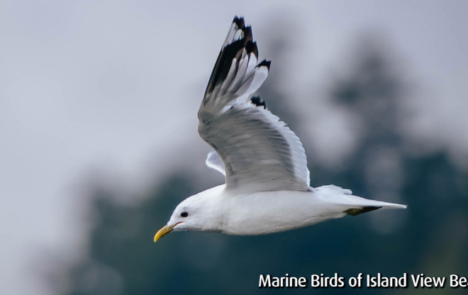
Marine Birds of Island View Beach

Winging it with Bats and HAT (Guided Walk) - All Ages Elk/Beaver Lake Regional Park (Saanich) Join CRD Regional Parks naturalists and the Habitat Acquisition Trust on a walk to explore the wonderful world of bats. Where do bats live? What do they eat? Participate in activities designed to help you learn more about the world's only true flying mammals. Hopefully we will see bats in action as they emerge at dusk and swoop through the air feeding on flying insects. Meeting place: The Beaver Lake Picnic Shelter at the Filter Beds parking lot. BC Transit #70, #71, #72 or #75 Trail description: 1km walk; variable trail surface; slight incline.