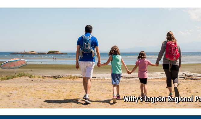
Witty's Lagoon Regional Park

We can all be caretakers of the forests and beaches, as local First Nations have been for thousands of years. First Peoples believe that all living things should be respected, from insects to eagles, from bees to bears, and from cougars to crabs. As you explore, please travel lightly on these lands and be respectful of the cultures and ecosystems that depend on them.