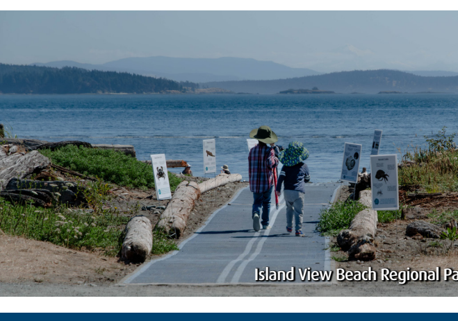
Island View Beach Regional Park