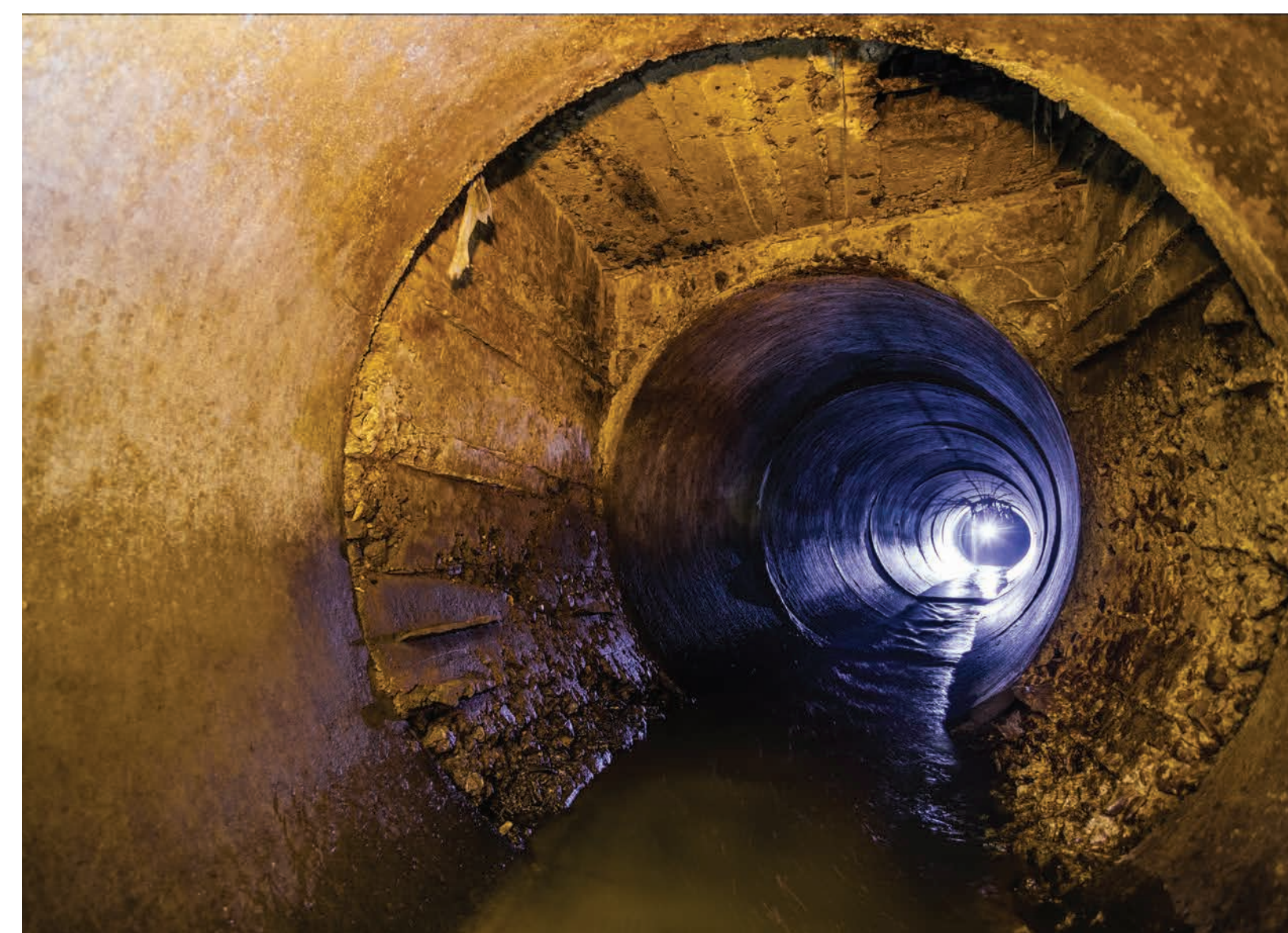
Bowker Creek flows beneath your feet here, in a concrete culvert.

Historic development in the Bowker Creek watershed has led to vegetation removal, construction near the creek and directing the creek channel into underground pipes. Along with the high proportion of impervious surfaces (roads, parking lots, roofs) these impacts resulted in a loss of riparian vegetation, decreased floodplain storage and increased downstream flooding and erosion. This has fragmented the creek corridor, causing habitat loss for fish, birds and other wildlife and lost opportunities for pedestrians and cyclists along this corridor.