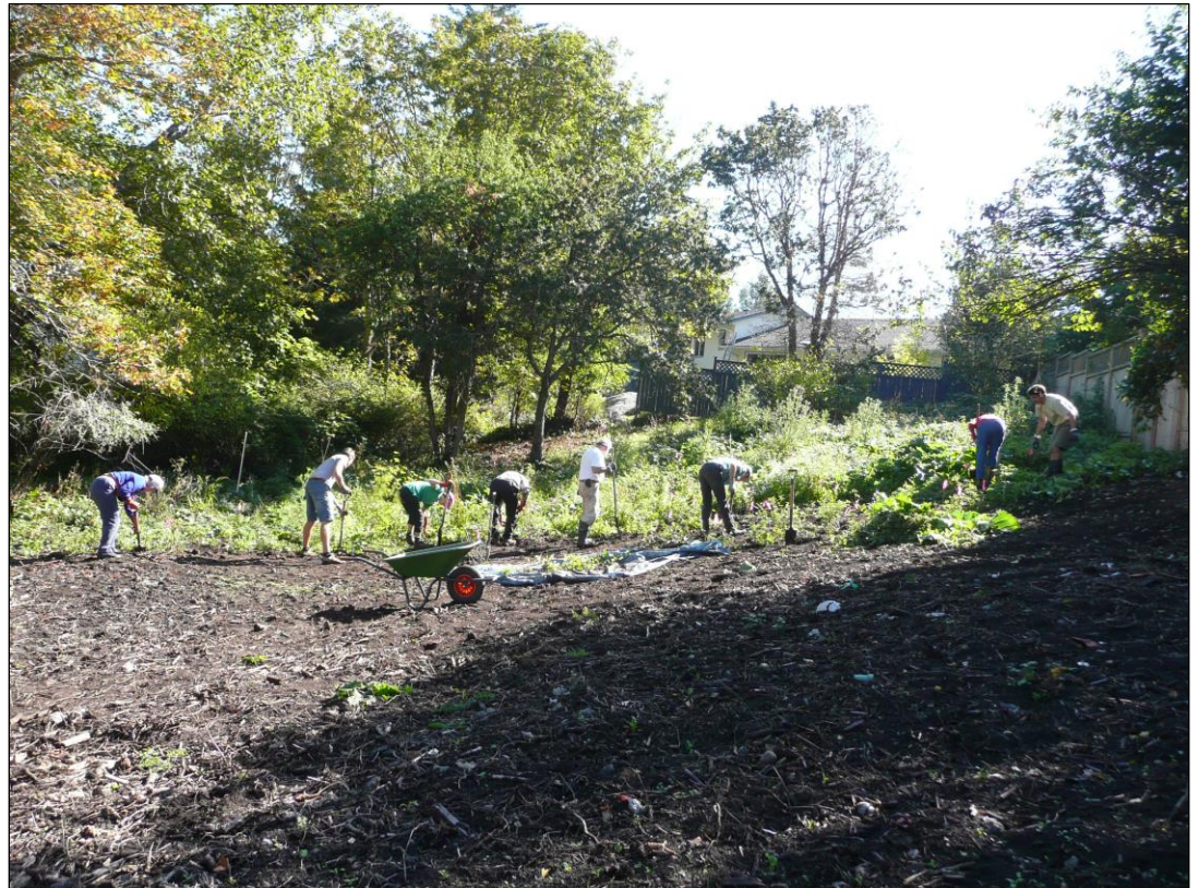
Volunteers weeding September 2010