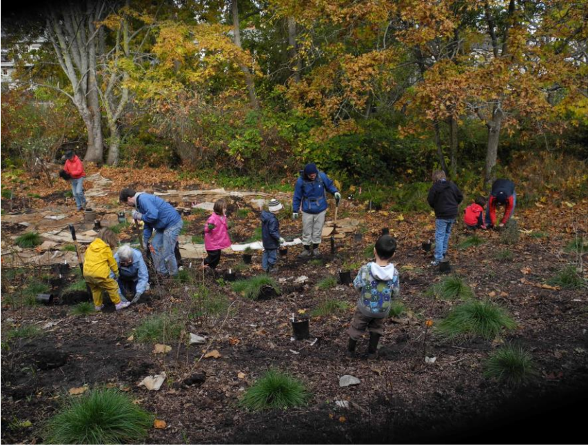
Planting native vegetation November 2011