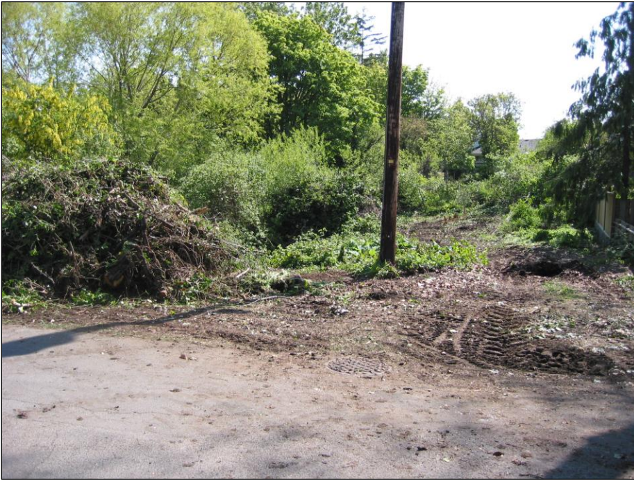
After initial clearing by bulldozer, May 2007