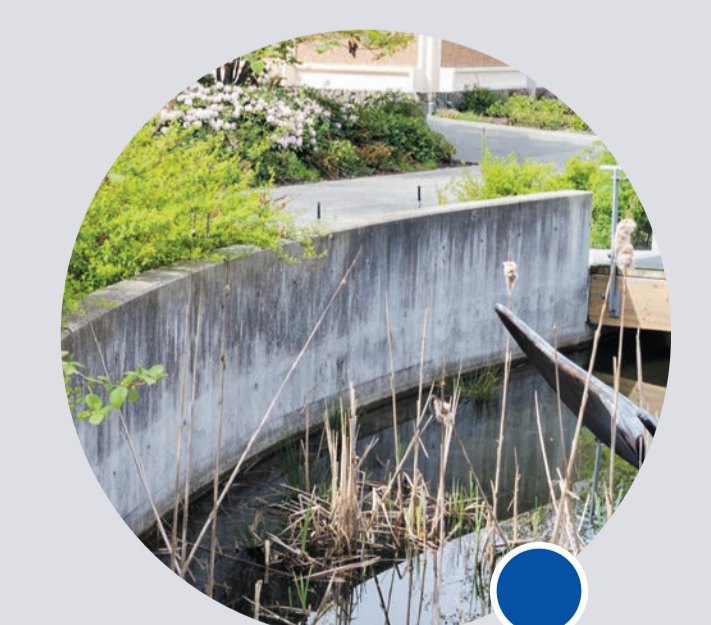
WATER DETENTION OR BIOSWALE